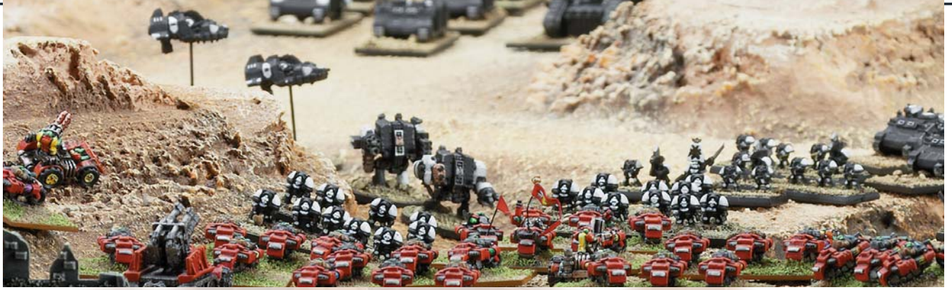
The Black Templars try to hold back the advance of the Speed Freeks, until much needed reinforcements arrive.

Finally, some players have asked if this approach means that they can't use models unless they are painted in exactly the right colour scheme for the army list being used. This categorically is not the case. Although the army lists are specific, they can be used quite happily as stand-in lists for models painted to represent other armies. For example, if you have a Blood Angels Space Marine chapter, then you can use the models with the Codex Astartes army list, or at least you can until we publish an army list specifically for the Blood Angels. By the same token, if you have a Cadian Imperial Guard army, you can use your models with the Steel Legion army list until we publish an army list specifically for Cadian regiments, and so on.