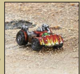
Above Left: Mekaniak Speedsta.